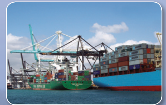
Ship departures or arrivals are dependent upon times of optimal current conditions.

Channel dredging, storms, changes in watershed hydrology and sediment loading, and coastal development can significantly alter the physical geography of our nation’s ports and waterways, resulting in potential modifications to tidal flow and circulatory patterns. Such variations may impact the existing tidal current predictions. NCOP puts a priority on updating predictions in these regions, as well as updating predictions that are based on data collected with older equipment that may not have enabled the most accurate predictions to be provided. NCOP also considers factors such as volume and type of cargo moved, strength of tidal currents, and user requests to prioritize survey areas. Recent major surveys have been conducted in Alaskan waters and in San Francisco, Delaware, Humboldt and Chesapeake Bays. Over the next 10 years, NCOP will update over 700 stations at numerous locations in the Tidal Current Tables. NCOP’s operational expertise, knowledge of current dynamics, and